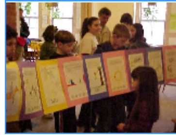
Creating our own “Megillah” at Purim