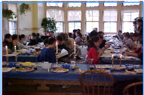
Students learn about Passover at our model Seder.